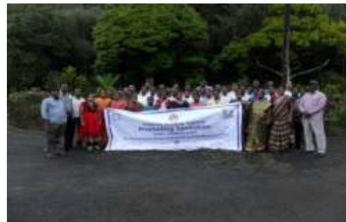
Image 1 and 2: Government Engineers & officers from Tamil Nadu Training on Convergence of NBA & MGNREGS at Kodaikanal

Government Engineers and Officers participated in the first batch and 39 Officers attended the second batch of training. The participants are Executive Engineers, Block Development Officers, Assistant Engineers, NBA District/ Block Coordinators.