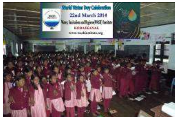
Image 17 Students taking a pledge in World Water Day 2014 Celebrations

WASHi celebrated the world water day - 2014 with full zest at St. Teresa High school, Kodaikanal, Tamil Nadu on 22nd March 2014. On that eve, more than one hundred student leaders were educated on the theme of the year 2014 “Water and Energy”. As part of the celebration WASHi in collaboration with School authorities organized a tree planting program in the school campus. The program who also encouraged children to take a pledge to save water and the environment to make the world better.