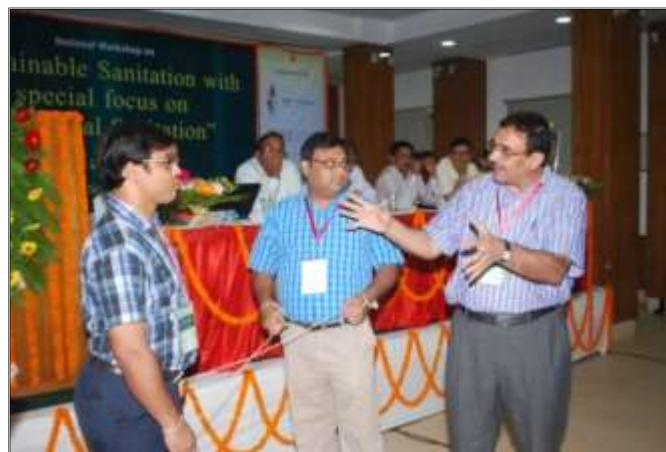
Image 12 Participatory BCC Session in Progress