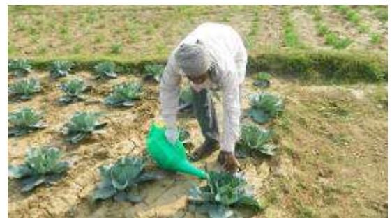
Image 13 Application of urine for vegetable crops

Activities of the project included construction of ECOSAN toilets - both individual and community - construction of Compostera toilets, construction of sanitation complexes in urban slums, providing capacity building training on CLTS, installation of solar energy panels, setting up of a fully fledged water quality testing laboratory and bringing out various publications of the research activities carried out. The urine application research project on crops gave encouraging results and the farmers reported harvesting a greater quantity of vegetables. The ECOSAN toilets have been found to be the ideal model for the flood affected areas of Bihar and to have increased the output of vegetables. Enthused by the outcome of the living examples of ECOSAN toilets, neighbouring farmers and villagers came forward to construct toilets at their homes and practice urine application to crops to enhance yields from farms and kitchen gardens.