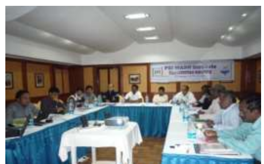
Image 14 WASHi PSI Consultation workshop meeting at Kodaikanal

In another major project being carried out in collaboration with Population Services International in Bihar, the Institute was involved in capacity building training to all the key actors in the value chain: masons, sales managers, turn-key solution