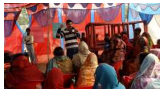
Image 9 Training to PRI, PTA on Hygiene promotion Techniques

On the request of ADITHI-Plan, Muzaffarpur, WASHi conducted 7 one-day community level workshops for PRIs, Parent Teachers Association (PTA), School Management Committee (SMC) members, Teaching and Non-Teaching Staff and Community Leaders on water sanitation and hygiene issues in different project areas of ADITHI- Plan PU at 7 different locations in December 2013. 410 persons were trained in this programme in total.