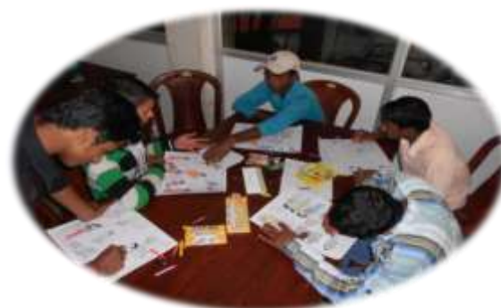
Image 20 Children Workshop for creating theme based calendar 2014

The Institute, in association with REAL, Dindigul brought out thematic Desktop Calendar on Water Sanitation Hygiene and an Annual Planner for 2014 with the support of Plan – India and Water for People. The theme and picture for the calendar were developed and drawn by school children of Muzaffarpur, Bihar centred on various issues of water, sanitation and hygiene aspects by organizing a three day workshop during November, 2013. The desktop calendar and year planner were widely circulated among the Government, INGOs, NGOs and stakeholders.