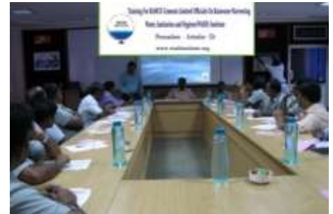
Image 7 Training on Water harvesting to engineers RAMCO cements Tamil

On the request of RAMCO cements Tamil Nadu, WASHi organized one day capacity building training on 'Water harvesting technology' in March 2014 at Pennadam in Tamil Nadu to 25 Engineers and senior level staffs. In addition WASHi also provided technical support to RAMCO cements on Rain Water Harvesting Technology and Water Quality Management in their mines area at Alathiyur and Pandalkudi in Tamil Nadu.