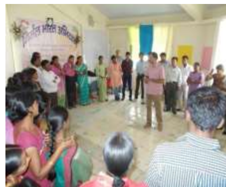
Image 4 CLTS training to PARDS, Jharkhand

To address the issue of open defecation, the District water and sanitation committee Dhanbad, Jharkhand requested WASHi to conduct training on Community Led Total Sanitation (CLTS) technique to staff of NGO Prince Art and Rural Development Society (PARDS), Dhanbad, Jharkhand. The 5 days training program on CLTS approach was conducted during 25-29th March 2014 at Krishi Vigyan Kendra, Dhanbad, Jharkhand. Eighty participants comprising of Block Coordinators, Cluster Coordinators, Mukhiyas and Jalsahiyas undergone the training.