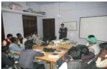
Image 3 Training on ecological sanitation & hygiene promotion – Sheohar, Bihar.

WASHi conducted two batches of training on Ecological sanitation and hygiene promotion to CSOs supported by Water for People at Sheohar, Bihar. 58 participants comprising of Secretary of NGOs, Hygiene Coordinators, Water Coordinators, Community Mobilizers, Account Officers and Master Masons participated in the training held in November 2013. This program was supported by Water for People.