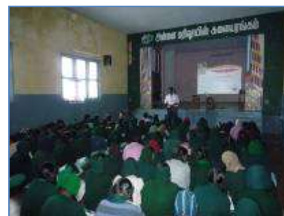
Image 10 Hygiene promotion training to School Children, Kodaikanal

As part of promoting hygienic promotion among school children, a one day awareness training program was conducted at St. John's Girls Higher Secondary School in Kodaikanal, Tamil Nadu on 18th February 2014. 100 Girl Student leaders along with teachers participated. The students were taught about water borne diseases, their prevention and importance of safe drinking water. In addition a practical demo on Handwashing was done after explaining the importance of Hand Wash at critical times.