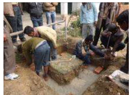
Image 8 Training to Master masons

A five day skill building training for masons on the "Construction of Sanitary Toilets" was organized by WASHi at Parsa Bazaar in Fulwari Sharif, Bihar in January 2014 with the support of Population Services International. This was followed by 16 more batches of training February to June 2014 in different Districts of Bihar. In total 156 master masons were trained.