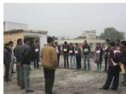
Image 6 Training on Sanitation Marketing to Sales personnel

In addition WASHi conducted another three days training program on Sanitation marketing with the support of PSI at