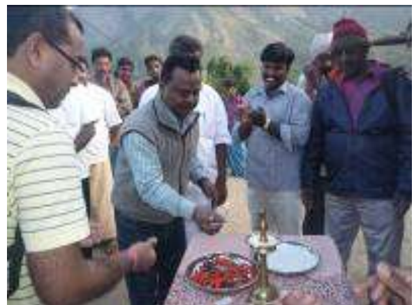
Image 1 Declaration of ODF village, Samiyaralakudi, Vattavada, Kerala Image 16 Plan India team participating ODF declaration Vattavada, Kerala

The team were impressed by the success of the sanitation project in Vattavada which had brought positive impacts to the community and they suggested creating a video documentation of the project in order to replicate it elsewhere.